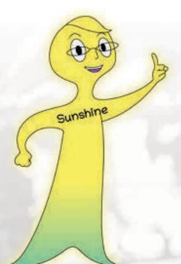
Initially funded exclusively by the Ackroyd Family Foundation, now several PSL Partners in Mission have joined in supporting this important program. Funds earned have purchased such community enhancements as garden planters, solar lighting for outdoor gardens, counter top ice makers for residents, Amazon Echo devices for music and meditation, fitness instruction, and puzzles for mental stimulation.

Based upon the success of the Healthier Living Challenge, the Sunshine Endowment for Healthier Living was established to ensure the Healthier Living Challenge lives on and that residents of the affordable communities continue to be encouraged to live healthier lives.