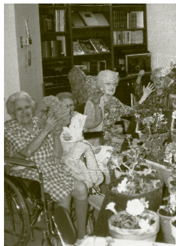
50th Year – Residents: 750