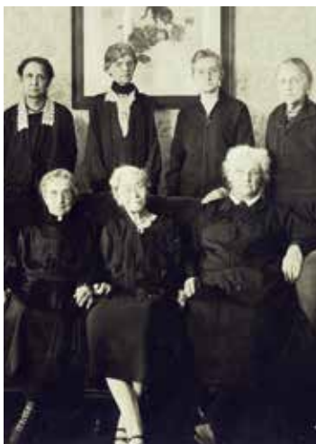
25th Year – Residents: 82