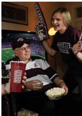
75th Year – Residents: 4,100