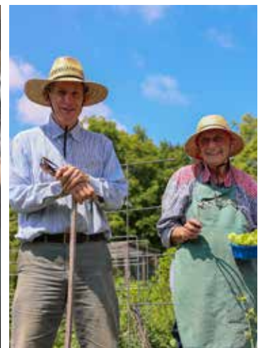
99th Year – Residents: 6,000